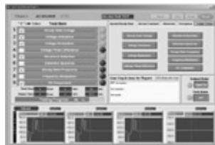
Aerospace Testing : MIL-STD-704F