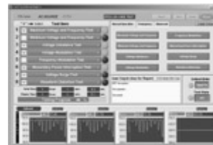
Aerospace Testing : RTCA DO-160D