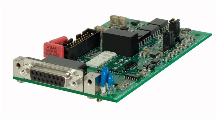
Card for inserting in power supply