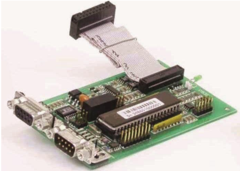
Card for inserting in power supply